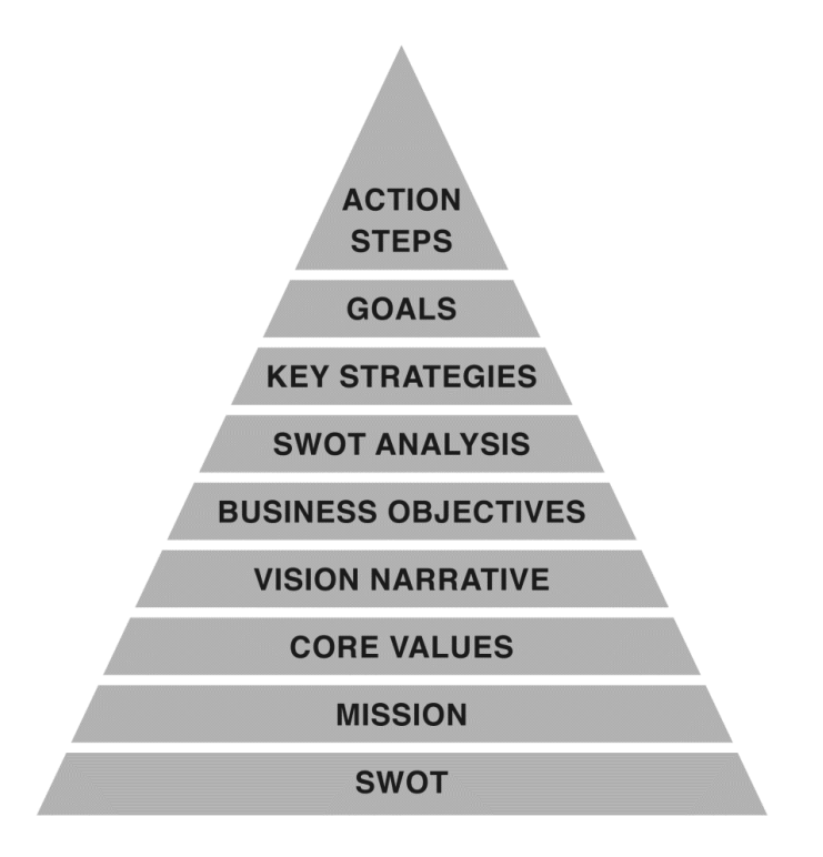
The Layers of the SSP Pyramid

was the starting point for this book (Part 2 of the book walks through the SSP in detail).